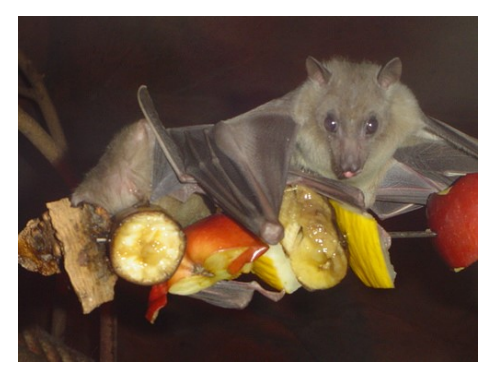
Aw, come on, Lenda, aren't I cute?