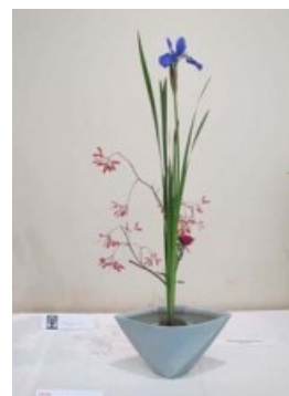
2015 Exhibition design

The Seattle Chapter 19, of Ikebana International, chartered March 16, 1959, is dedicated to cultivating and perpetuating the study of Ikebana by demonstrations and public exhibitions, with a deep purpose of establishing a better relationship among all people. The chapter is celebrating its 50th anniversary in 2009.