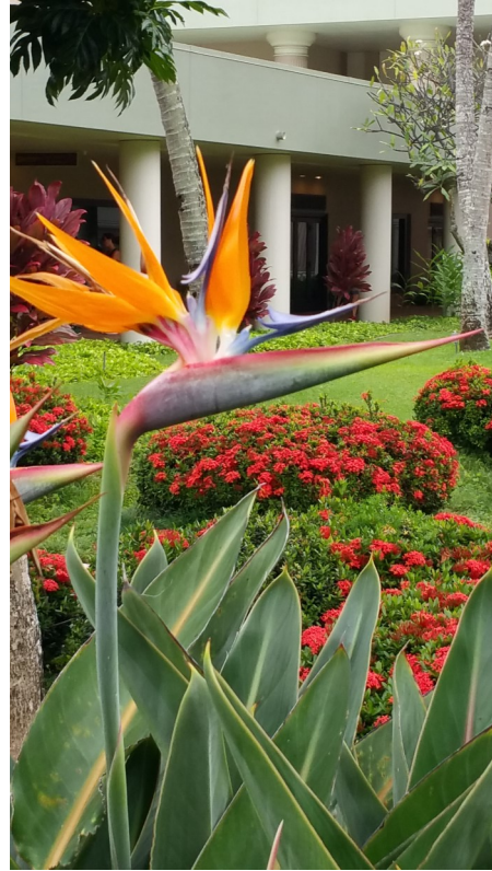
Lenda's picture of a Hawaiian Bird of Paradise ( Strelitzia reginae )

Hawaii's beauty in nature is colorful, patterned with textures and amazingly prolific.