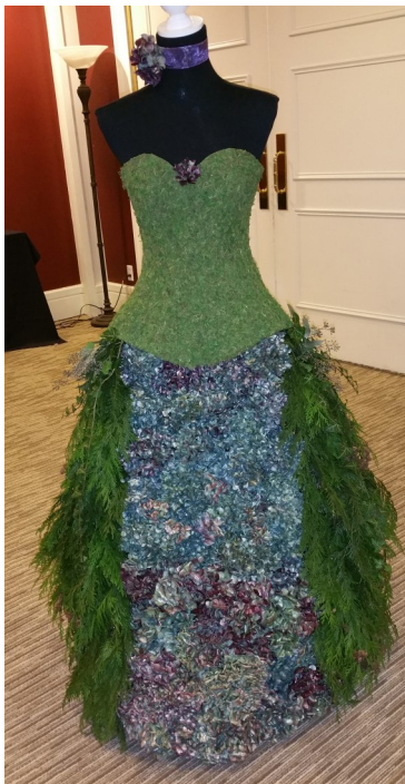
Winner, "Coco Chanel": decorated dress form