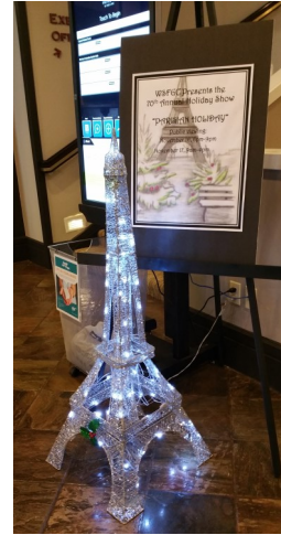
Entrance display for the WSFGC show