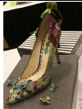
Winner, "Hermes": decorated adult dress shoe, by Nonna Crook of Greater Seattle