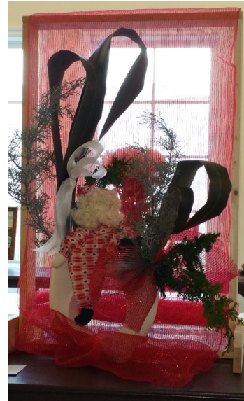
June Ann's "transparent" Floral Design