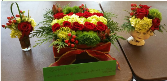
Sandra Roberts three arrangements made from three bunches of purchased flowers