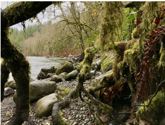
South fork, Snoqualmie River