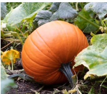
Pumpkin in Our Garden

c/o Cate Mueller, Editor 24205 SE Tiger Mtn Rd Issaquah, WA 98027-7336